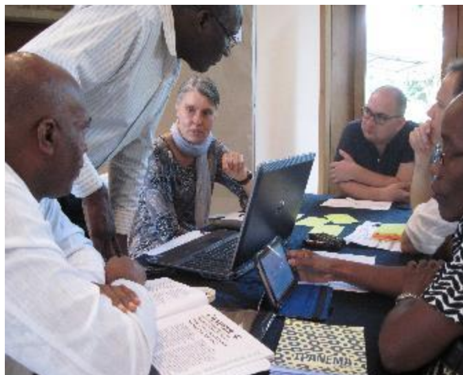
Participants discuss opportunities and challenges for securing high-level political support for NAPs.

Participants worked in small groups to consider challenges and opportunities for securing high-level political support, options for addressing these, and the roles of different actors. Discussions focused on four main areas: evidence and capacity, integration with existing initiatives and priorities, communication, and leveraging opportunities and resources. Each of these four areas correspond to a series of factors affecting political commitment (outlined in Figure 2 below) and associated opportunities.