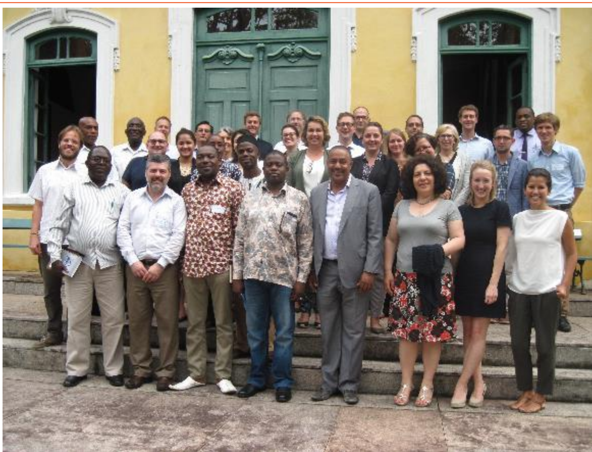
Participants in the first Targeted Topics Forum.

Participants also emphasized the importance of south-south sharing on how NAP processes are unfolding. The NAP Global Network and the Targeted Topics Forums can play an important role by supporting an understanding of what the NAP process looks like in practice.