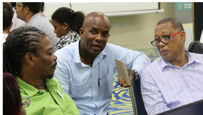
Colleagues at a Caribbean NAP Assembly in October 2016.

“ We now have both private sector and civil society represented on our National Climate Change Committee as well as our project steering committees.”