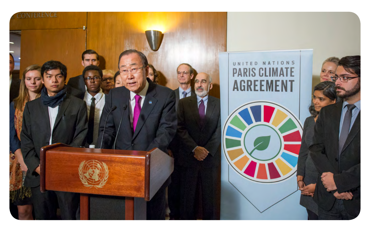
Secretary-General Ban Ki-moon speaks to journalists on the entry into force of the Paris Agreement on climate change.

Within countries, a number of policy processes have been established under these global agendas, elaborating individual commitments, strategies and plans for meeting the objectives therein. These include strategies aimed at achieving the SDGs; National Adaptation Plans (NAPs) and Nationally Determined Contributions (NDCs) under the Paris Agreement; and DRR strategies under the Sendai Framework. These represent key national policy processes that can advance climate-resilient development by facilitating systematic consideration of climate change in decision-making (United States Agency for International Development, 2014). Alignment of these different processes can increase coherence, efficiency and effectiveness towards development outcomes that are resilient and sustainable (Bouyé, Harmeling & Schulz, 2018; Hammill & Price-Kelly, 2016, 2017; UNFCCC, 2017).