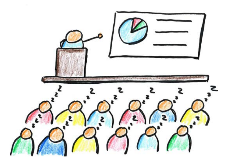
Too many gatherings are characterized by packed agendas, endless PowerPoint presentations, and little time for creativity, interaction or problem solving.

Successfully developing and implementing a National Adaptation Plan (NAP) process requires high levels of collaboration, often between groups who have not worked together and who might have strong differences of opinion on how to proceed. This collaboration might be cross-ministerial, with civil society organizations, with the private sector, and even with researchers and the media. In all of these cases, it is essential to create spaces where people can work together to better understand the challenges and prioritize adaptation actions that will help the country confront the impacts of climate change. As a result, the path to effective NAP planning and effective adaptation is one of many gatherings, meetings, workshops and forums. Some of these gatherings generate ground-breaking ideas, foster new partnerships and inspire positive action.Many of them, sadly, do not. They are instead