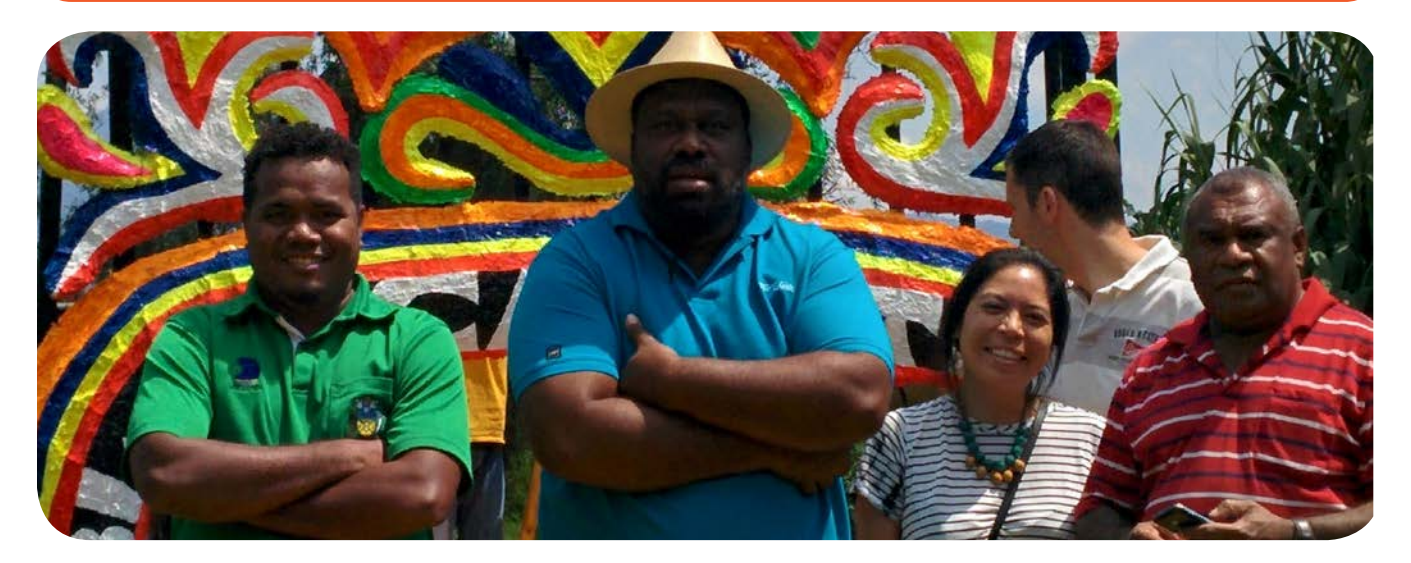
Field trips and social events are valuable for building personal connections between a group.

3. Strategies for quick closure: All events need a good ending; however, sometimes sessions have overrun and time is short. One-word reflections from each participant can be useful in this context.