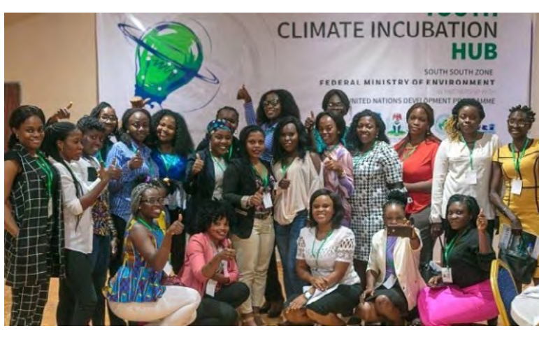
Nigerian youths after a workshop.

At the national level, the Government of Nigeria recognizes the significant role of young people in national development and the need to create an enabling environment for them to contribute to the country's sustainable development. These are reflected in Nigeria's National Youth Policy (Federal Republic of Nigeria, 2019). While the policy does not speak expressly about how youths might engage with the challenges of climate change, it states in Section 2.2 that it aligns